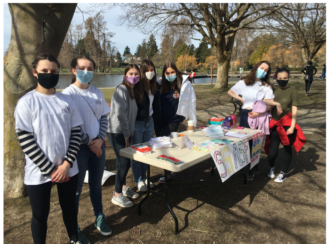
Students gather at Greenlake park to hold a walk-a-thon fundraiser, raising over $1,200 and invigorating new 9th grade members.